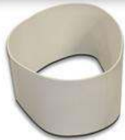
White FDA Nitrile Sleeve