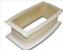
FDA Pure Gum Connector with White Nitrile Flanges