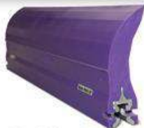
Rockline Urethane Belt Cleaner Blade