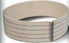
Cotton Belt with Clipper Belt Lacing